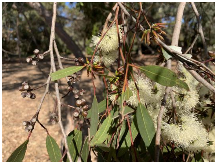
Eucalyptus arachnaea . The species epithet ' arachnaea ' refers to the spidery cluster of flower buds, in clusters of up to 13.