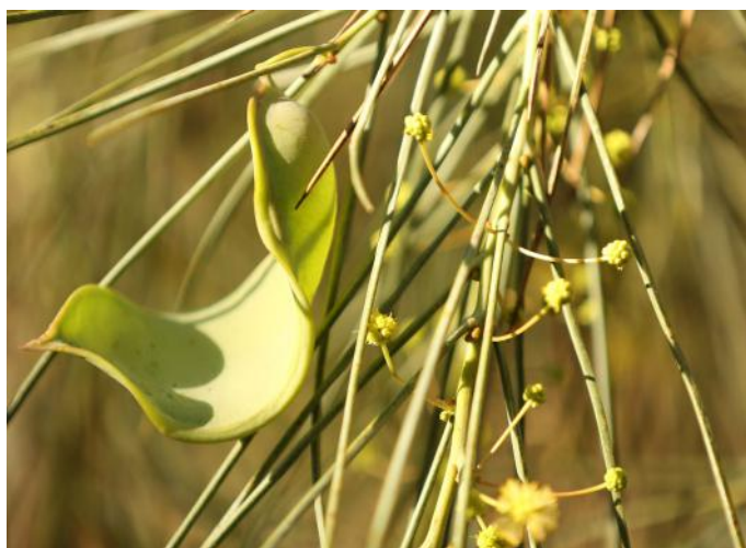
Acacia peuce FABACEAE Waddy. NT, Qld. See the pod, the needle-like phyllodes, flowers and buds on this acacia . This species survives on a rainfall of 150mm. The wood is very hard and was used to produce clubs or the waddy by the local aborigines. The conservation status is Vulnerable. JB.