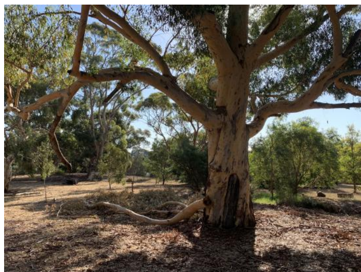
Eucalyptus cladocalyx MYRTACEAE Sugar gum. SA. 1960. Endemic to SA. Three geographical variants are known. A large bough has dropped in response to the below average summer rainfall. JB.