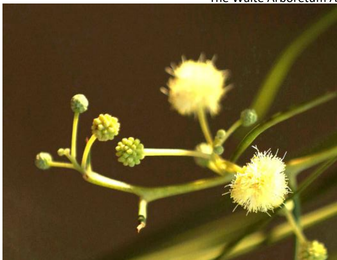
Acacia stenophylla FABACEAE Eumong, river cooba SA, WA, Vic. NSW, NT, Qld 1975 Acacia flowers are an aggregate, each swollen flower bud making up the capitate head in this species, (rod like flowers also in some acacia species) There seem to be no specific pollinators for acacias owing to the lack of nectar in the flowers. JB

The Waite Arboretum App has more information about these plant species.