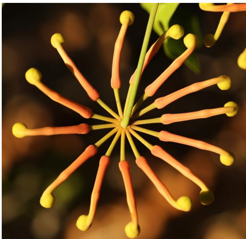
Stenocarpus sinuatus Firewheel tree NSW, QLD. PROTEACEAE Flowers appear from late summer on, in clusters of 6-20 at the end of the branches.