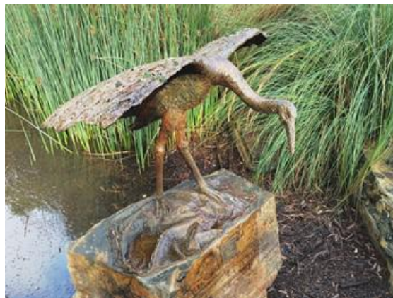
Waterbirds sculpture by Meliesa Judge, at the Waite Arboretum.