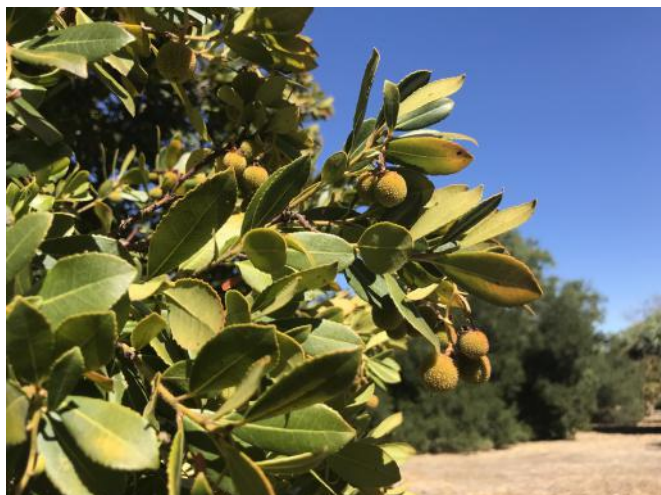
Arbutus unedo ERICACEAE Irish Strawberry tree. S. Europe 1928. The fruit matures into a red berry and is edible.