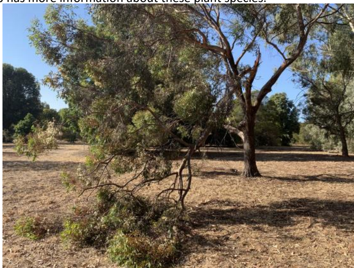
Eucalyptus arachnaea MYRTACEAE Black-stemmed mallee. WA. Although in flower in March, this tree has self-pruned due to the hot dry conditions. JB.