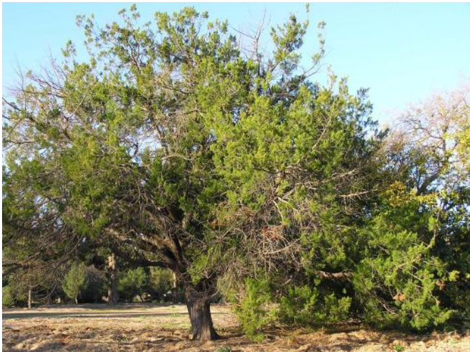
Juniperus procera . Arboretum specimen #742 D8.

There are two specimens of Juniperus procera in the Waite Arboretum: #571, planted in 1928 and #742, planted in 1929. Common names for this species include African pencil cedar, East African cedar, East African juniper and pencil cedar. Tree #571 was propagated from a parent plant from the Adelaide Botanic Garden and #742 from a Melbourne Botanic Garden plant. There are other J. procera in Australia. John Sandham, Collections Development Officer for the Botanic Gardens of Adelaide, said there are two accessions at Mt Lofty Botanic Garden, one of Garden origin, the other of known wild origin, and both Sydney and Mount Tomah Botanic Gardens have it as part of their living collections.