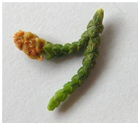
Male cone (enlarged).

J. procera is largely dioecious with separate male and female plants, but some individual plants produce both male and female cones. It is wind pollinated. Male cones are small (2-5mm), solitary, and terminal on short branchlets, yellow when young and brown when mature. Female cones are terminal on short erect branchlets and consist of soft, thick scales which have fused to form a berry-like fruit. When mature the purplish fleshy fruit (3-7mm) contains up to 4 seeds. Seeds are usually fertile and in nursery conditions germination rates