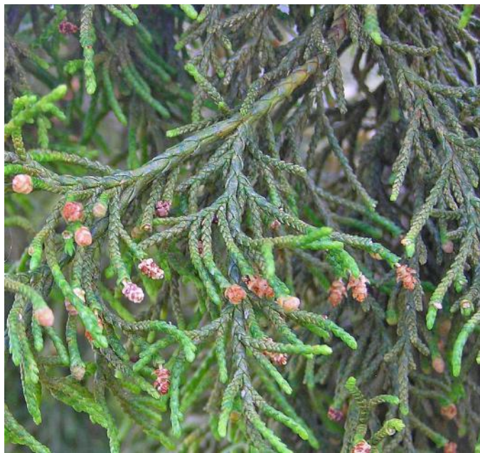
Juniperus procera mature leaves, new growth and male cones terminal on short branchlets.

the tree matures the leaves gradually change colour to become glaucous. The mature leaves are scale like, between 0.5-3 mm long, and arranged in whorls of three with a long narrow translucent margin and elliptic oil gland on the back near the base. The thin, fibrous bark is pale to reddish-brown, with shallow longitudinal fissures. It exfoliates in thin papery strips.