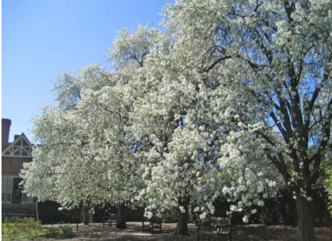
Pyrus calleryana in the Urrbrae House garden.

The Arboretum pears flowered spectacularly this year and the four in the Urrbrae House garden were at their peak for Treenet.