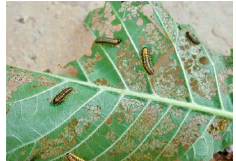
Leaf damage.

larvae feed voraciously on the leaves and can defoliate a mature tree by mid-summer. It was first discovered in Australia on the Mornington Peninsula, Victoria in 1989, found in Launceston in 2002 and detected in Adelaide in January 2011 in private garden in Malvern. This year it has already been found in many trees in the CBD of Adelaide especially around the North Terrace Cultural Precinct.