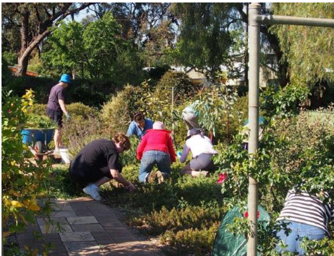
Mediterranean Garden Society SA members working in the Garden of Discovery.

A new teak bench seat, donated by the Chambers family, has been installed under the beautiful Chinese pistachio Pistacia chinensis #862 (B8) and provides a welcome resting place with a lovely outlook.