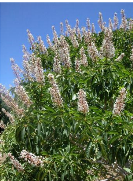
California Buckeye, Aesculus californica in late October.