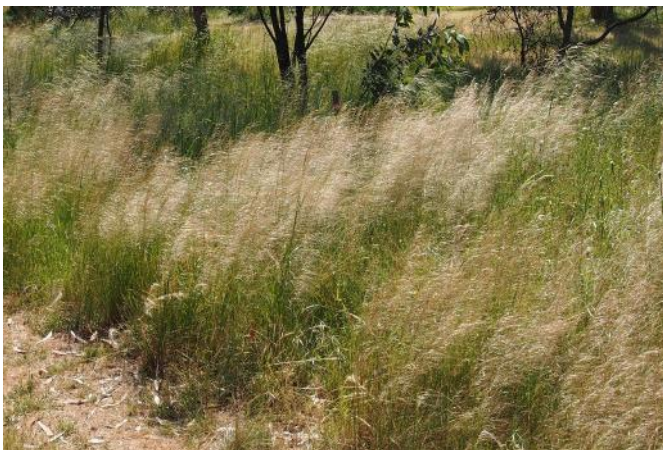
Austrostipa sp. in the grey box revegetation section.

Drifts of native spear and wallaby grasses are a lovely sight in full flower in the NW section of the Arboretum. The seeds will be harvested and propagated by Friends of the Waite Conservation Reserve for their revegetation project in the Waite Reserve next year.