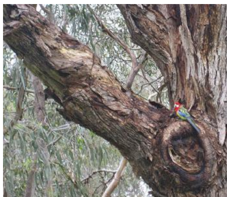
Also in the same area, one of the bird habitats constructed during the 2011 Treenet Symposium is in use. The Eastern Rosella is perched just to the right of the man-made nesting cavity.