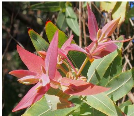
Broad-leaved apple myrtle, Angophora subvelutina .

Many of the gums, particularly the Angophora species have colourful new leaves or flower buds.