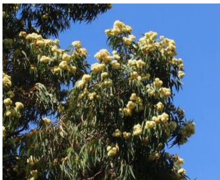
The yellow bloodwood, Corymbia eximia , in the grey box revegetation area is flowering profusely.