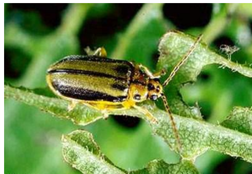
Elm beetle.

The beetle is small, only about 6 mm long, oval shaped, with black and yellow broad longitudinal stripes. The adults can easily be dispersed by hitch-hiking on clothing, boots, vehicles etc. So far, it has not been found in the Arboretum and we will be monitoring for it. However, it is probably only a matter of time, so if anyone finds an Elm Leaf Beetle please advise me. The two main controls are soil injection and micro-injection of trunks with an insecticide, but both methods have disadvantages. Trunk banding with chemicals or sticky tape may help break the cycle by trapping the larvae as they descend to the ground to pupate but success is limited if numbers are large and larvae simply drop to the ground or march over the bodies of their dead comrades. ELB certainly poses a threat to our Elm Avenue which this year is the lushest and healthiest I have seen it. For more information see The Friends of the Elms website at: http://home.vicnet.net.au/~fote/ElmsNeedFriends.pdf