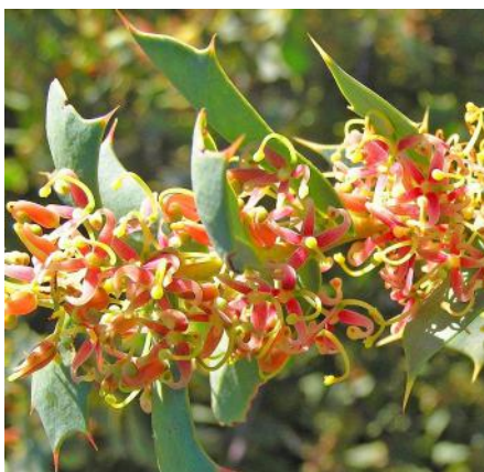
The hakeas are attractive with unusual leaves, colourful flowers and woody fruits. Hakea prostrata above has sharply pointed holly-like leaves.