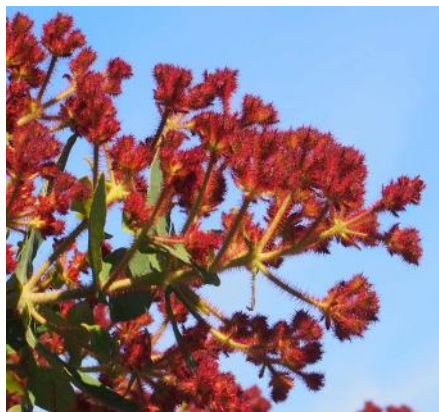
Buds on Angophora hispida have fine red hairs. Watch for the scented cream flowers as summer approaches.