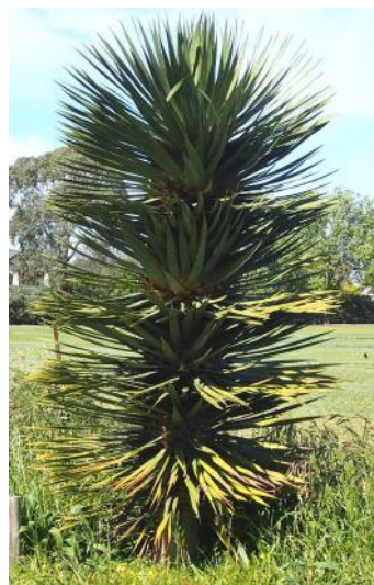
Dracaena draco ssp. ajgal #1717 (left) planted 2004 and #1712 (below)